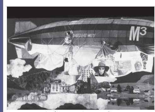
Archigram - Instant City