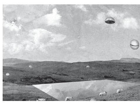
Super Studio - Continuous Monument