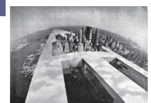
Super Studio - 12 Ideal Cities